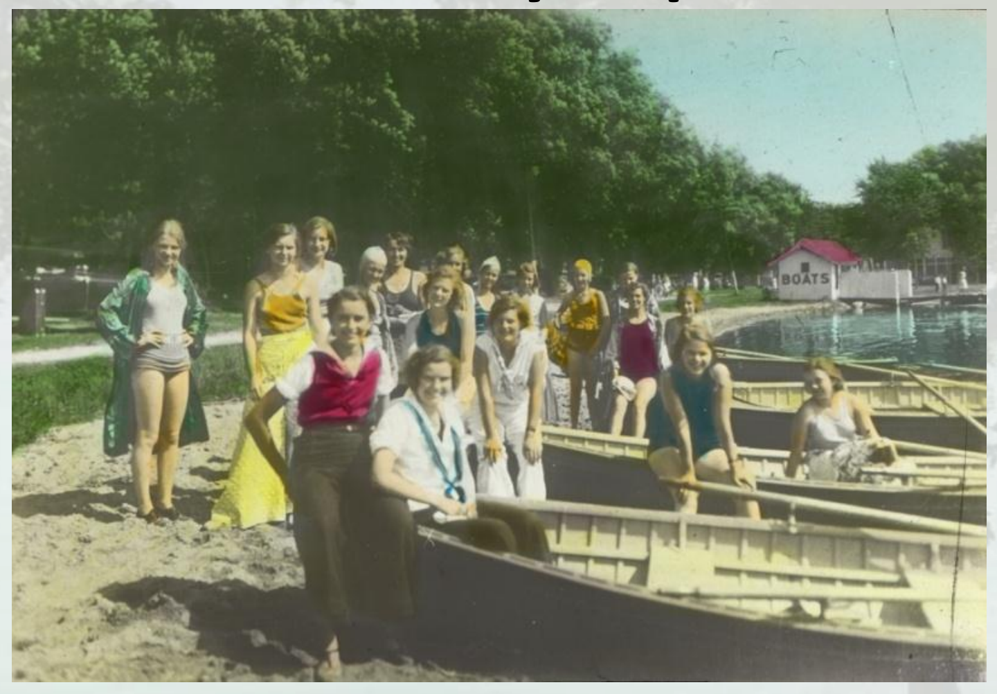
Economic -- Educational -- Environmental